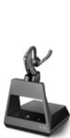
Voyager 5200 Office UC Series

The Blackwire family gives you a broad selection of corded UC devices that deliver outstanding audio quality and reliability, ease of use and price points to meet any budget.