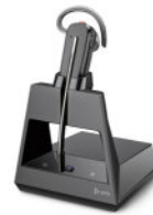
Voyager 4245 Office