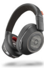
Voyager 8200 UC