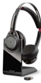
Voyager Focus UC