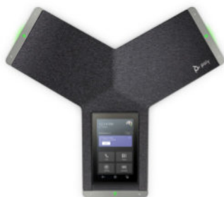
Poly Trio C60