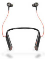
Voyager 6200 UC