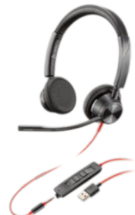
Blackwire 3300 Series (-M)