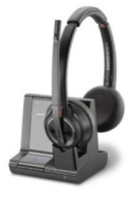
Savi 8200 Office UC Series