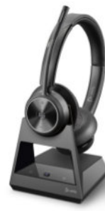
Savi 7300 Office Series