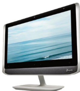
Poly Studio P21