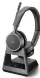
Voyager 4200 Office UC Series