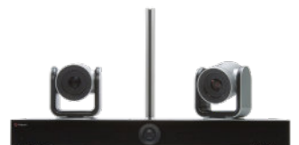
EagleEye Director II