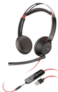
Blackwire 5200 Series