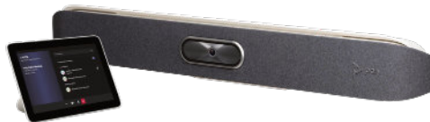
Poly Studio X50