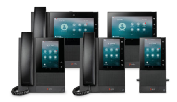
CCX Open SIP Series